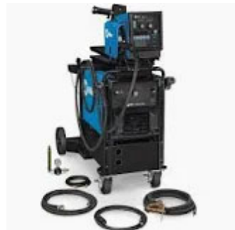
Mig / Tig Welding