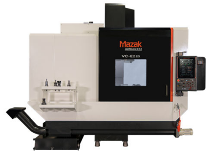
CNC Mills / Lathes