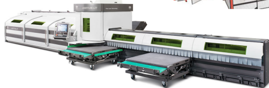
CNC Tube Laser "Fiber" Cutting