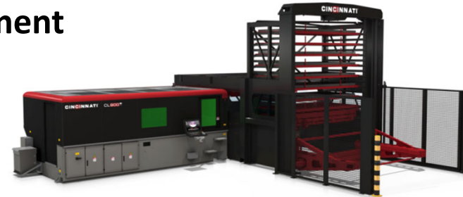
Automated CNC Laser "Fiber" Cutting