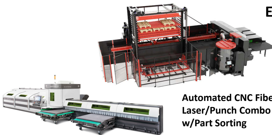
Automated CNC Fiber Laser/Punch Combo w/Part Sorting